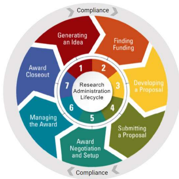
Figure 1. The following grant lifecycle wheel shows areas that count toward the twelve (12) hours of continuing education in research administration.

Research Development (e.g., communication of research and funding opportunities, proposal writing/editing, strategic research advancement, support of collaborative/team science)